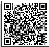
SCAN SURVEY QR CODE

Please fill out this short survey (we promise it's short...) to let us know what you'd like to see in future bulletins and shared resources.