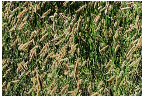
Blue Grama Bouteloua gracilis