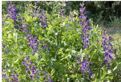
Blue False Indigo Baptisia australis