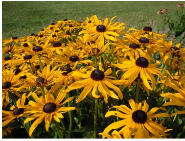
Black-eyed Susan Rudbeckia hirta