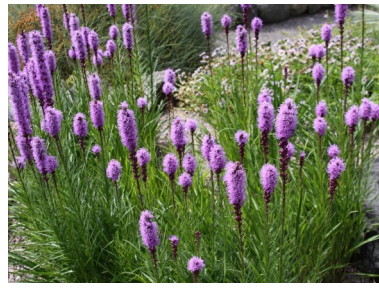
Blazing Star/Gayfeather Liatris spicata